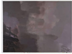
Les Rogers Large There 2009 Leo Koenig Inc.